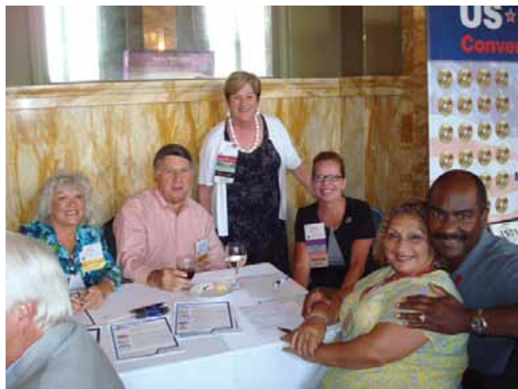
The Land Records Interest Group meets to discuss details for the Good Recorder vs. The Rogue Recorder .

I hope to see you at the next conference where we can continue to explore the issues and concerns with which we, as recorders, must deal on a regular basis.